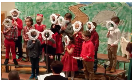
Sunday School Christmas Program, Sanctuary