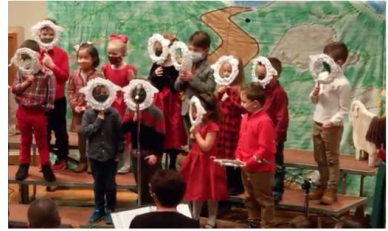
Sunday School Christmas Program, Sanctuary

Light 4:30PM Cocoa & Carols up the Night 5PM Tree Lighting