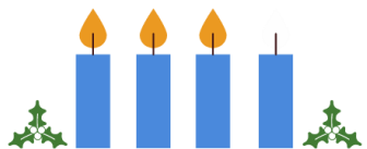
Advent III: Listen, God is Coming

Plants cost $15. Sign up by 12/19 to have dedications included in Christmas bulletins.