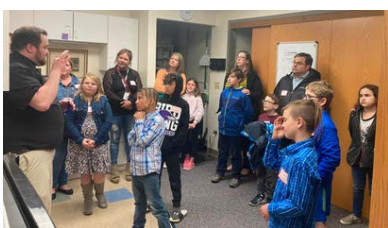
First Communion Preparation, May 1.