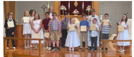
Faith Milestone Sunday, May 22.