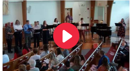
April 17, Easter Sunday. 6:30am Sunrise. 8:30am mid-morning; Children's Sermon. 11am; 12 member Praise Band music.