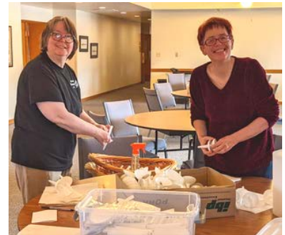
Musician. Lilies. Candles. Getting ready for Holy Week & Easter, April 2022.