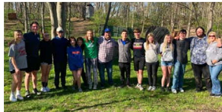
H.S. 1-day retreat, May 7.