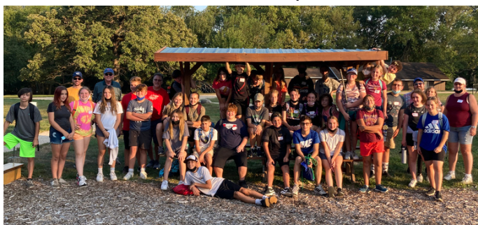
7th - 8th Grade Retreat Sept 18