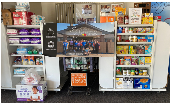
We stocked the shelves ~Thank you!