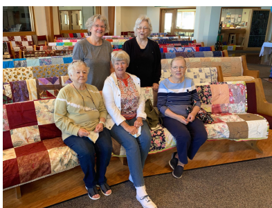
Blessing of the Quilts Sept. 25-26