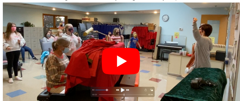
Youth Choir First Rehearsal Sept 22 {Click play button to play video}