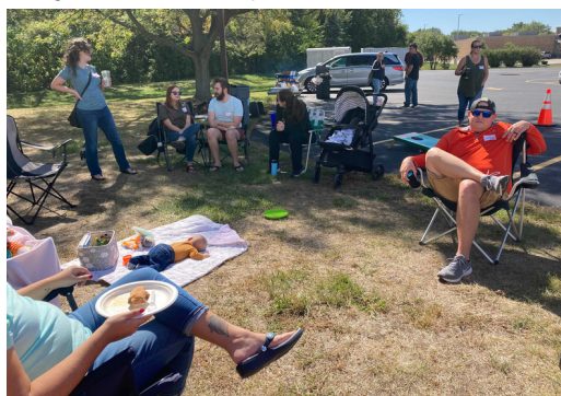
Young Adult Ministry Tailgate Party Sept 25