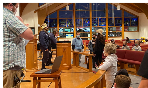
Confirmation Class Resumed Sept. 22