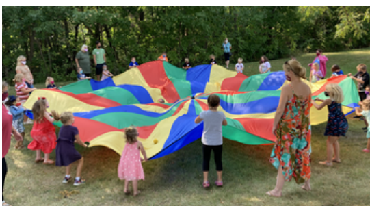
An amazing 1st day of Sunday school! Sept. 12