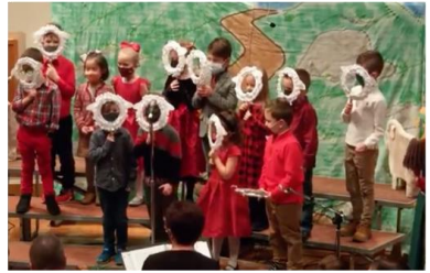
Sunday School Christmas Program, Sanctuary

Light 4:30PM Cocoa & Carols up the Night 5PM Tree Lighting